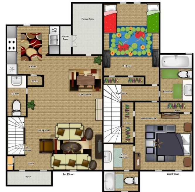
San Antonio Floorplan - 1,013 SQ FT 2 Bedroom, 2 1/2 Bath Townhome