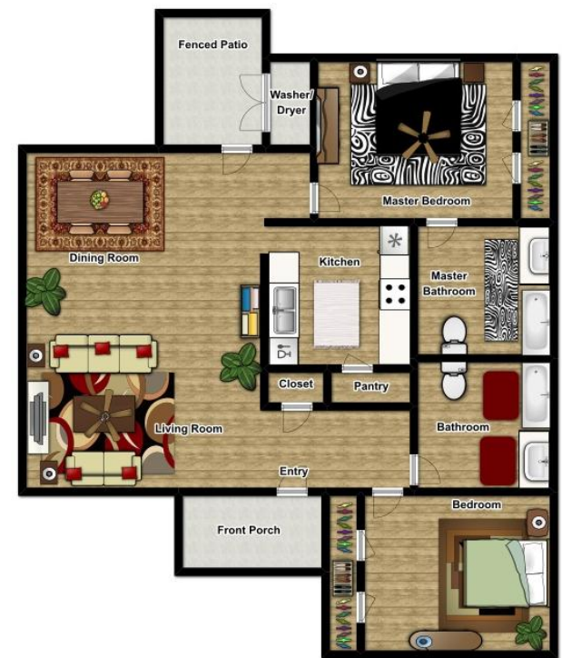
Austin Floorplan - 932 SQ FT 2 Bedroom, 2 Bathroom Flat