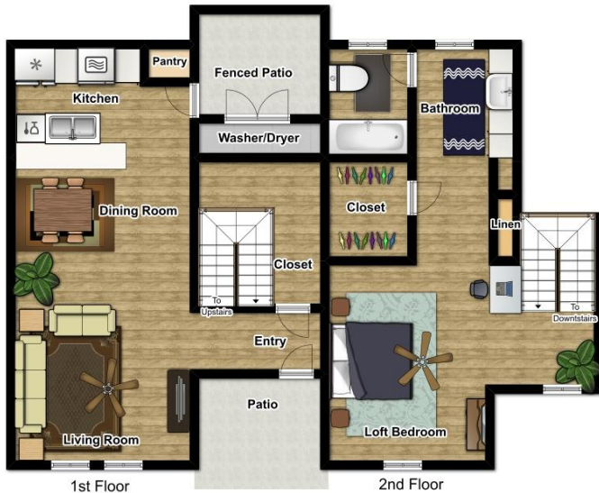
El Paso Floorplan - 812 SQ FT 1 Bedroom, 1 Bathroom Townhome