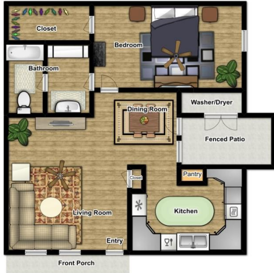
Amarillo Floorplan - 674 SQ FT 1 Bedroom, 1 Bathroom Flat

If you are looking for affordable housing, look no more! Reed Parque Townhomes is one of Houston's newest affordable apartment communities, offering 1, 2 and 3 bedroom townhomes in 1 and 2 story floor designs at an affordable rate. We are conveniently located at 288 and Reed Road, just minutes from the Medical Center, downtown, Reliant Park, the Galleria and several fine dining and entertainment establishments.