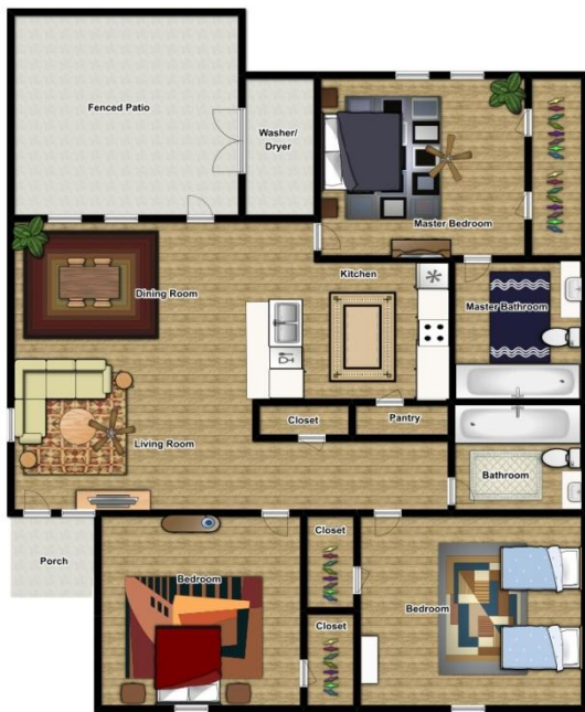
Dallas Floorplan - 1,059 SQ FT 3 Bedroom, 2 Bath Flat